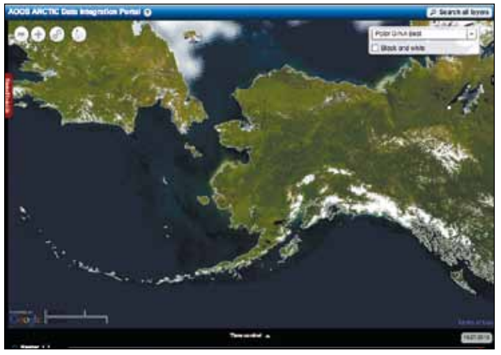
The Arctic portal includes the capacity to see changes in the environment over time. This NSIDC sea ice dataset shows the marked decrease in sea ice between October 1978 (top) and October 2012 (bottom).

This portal assimilates a broad variety of Arctic data layers for research, planning, and management to meet a variety of stakeholder needs.