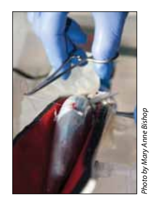
Researchers take measurements for the Herring Research Project.

Some key findings from the first field season: