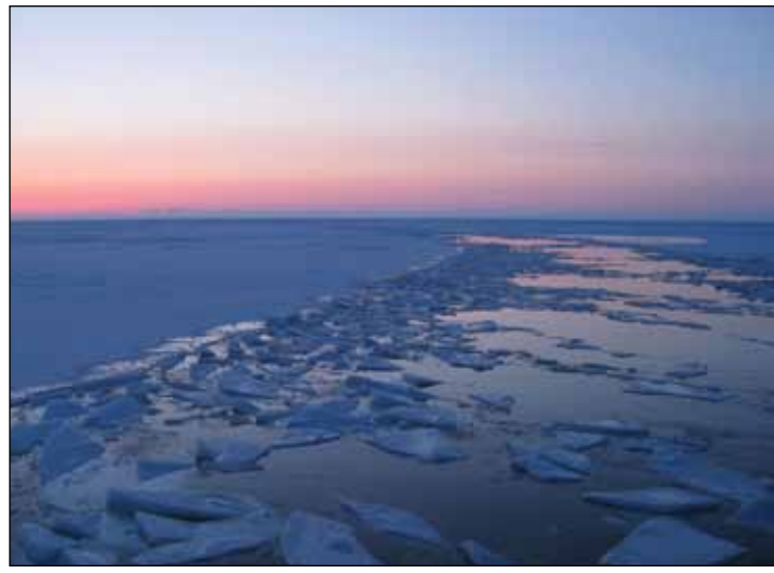
A view of Arctic horizon from aboard the Research Vessel Healy.

To comment on the draft plan, go to www.aoos.org.